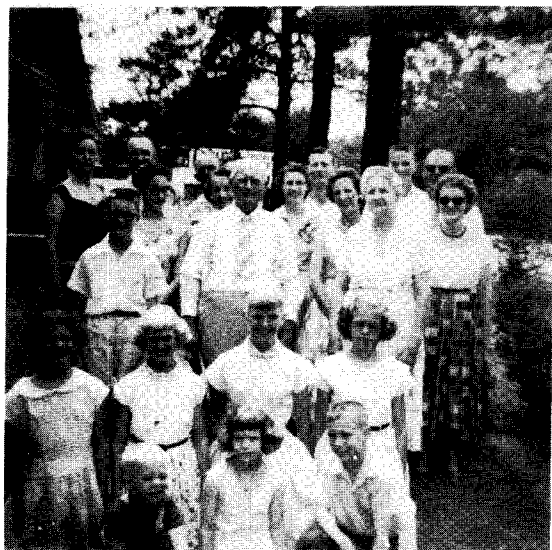
Family unites 1956